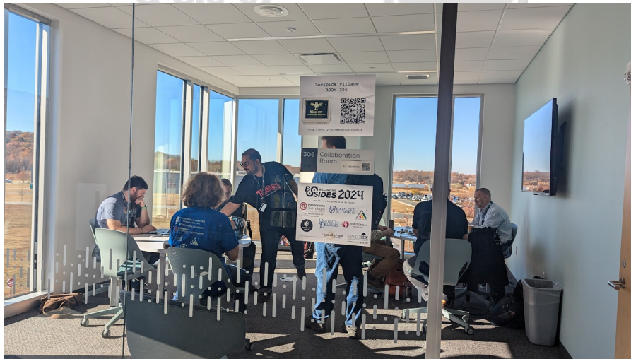
Lockpick Village 2024

Security BSides Delaware 2207 Concord Pike, #117 Wilmington, DE 19803 sponsor@bsidesdelaware.com